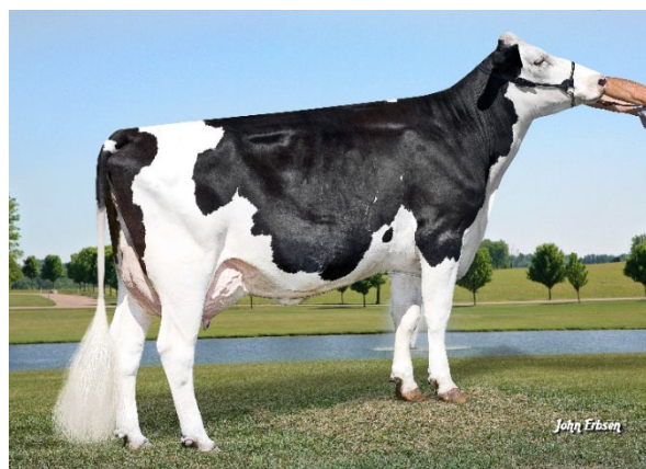
Montbeliarde × Holstein

1-10 305d 25912 lb m, 914 lb f, 806 lb p 2-10 305d 35572 lb m, 1340 lb f, 1099 lb p 3-09 305d 31683 lb m, 1328 lb f, 1012 lb p 4-11 305d 36691 lb m, 1341 lb f, 1119 lb p 5-11 305d 38173 lb m, 1306 lb f, 1170 lb p