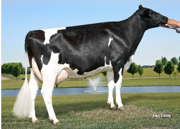
Viking Red × Holstein

1-10 305d 23680 lb m, 961 lb f, 755 lb p