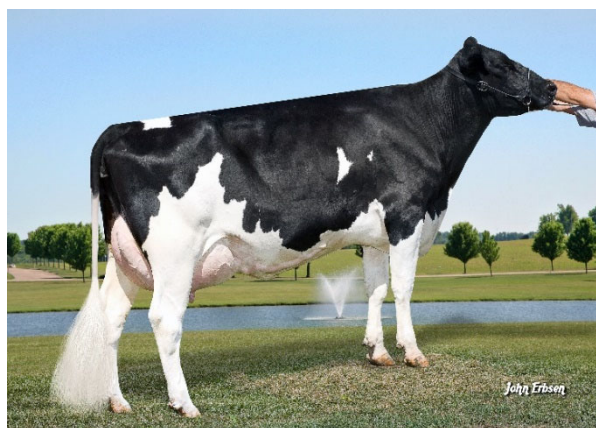
Viking Red × Holstein

Teat length. Teat length had a scale from 1 = short to 9 = long. The VR×HO 2-breed crossbreds were not different for teat length from their HO herdmates. However, the MO×HO 2-breed crossbreds had significantly longer teats than their HO herdmates in 2 nd lactation (+0.7) and 3 rd lactation (+0.4). The 3-breed MO×VR/HO crossbreds had slightly longer (+0.4 and +0.5) teat length on average than their HO herdmates in 1 st and 2 nd lactations. The HO-sired ProCROSS did not differ from their HO herdmates for teat length in 1 st lactation.