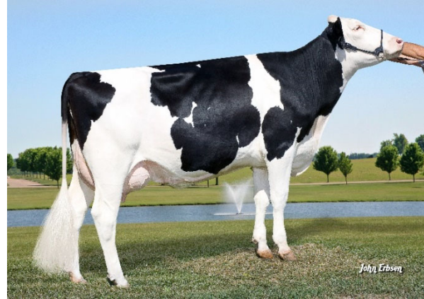
Montbeliarde × Holstein

1-10 305d 23680 lb m, 961 lb f, 755 lb p